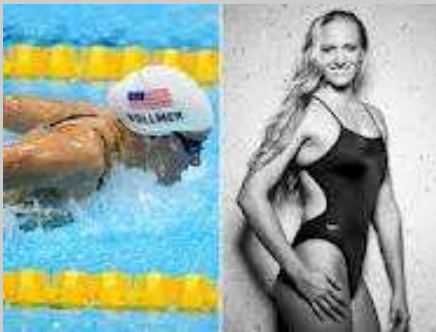
Dana Vollmer, 2012 Olympic Gold Medalist & World Record holder. Circle of Red Champion & Supporter of the Go Red for Women Movement.

Circle of Red Members are invited to exclusive gatherings to hear powerful messages from passion speaker and survivors. Each gathering is hosted at a different locale and boasts a fun and educational keynote speaker. In addition to educational events the Circle of Red will also be featured in local print media associated with events, have a photo shoot, and hold VIP seating to the Annual Go Red For Women Luncheon.